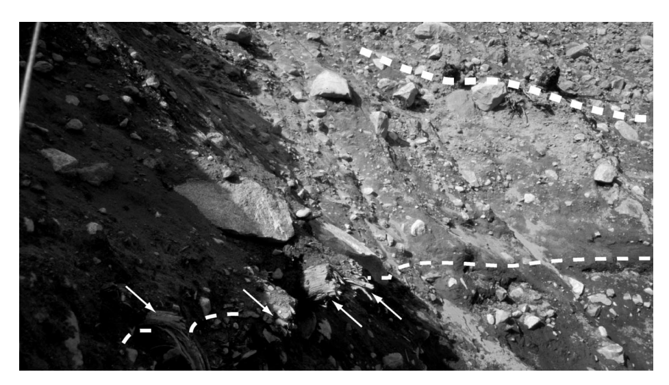
Figure 2. Dated logs (arrows; A.D. 540–770) and paleosol (thin dashed line; A.D. 420–620) buried by till during first millennium A.D. glacier advance at Lillooet Glacier in southern Coast Mountains (Reyes and Clague, 2004). Thick dashed line marks wood layer and paleosol developed on first millennium A.D. till that was buried during Little Ice Age glacier advance. Buried surfaces are separated by 4–6 m of vertical distance.

trital and/or in situ wood and commonly associated with a paleosol is covered by glacial sediments dating to the first millennium A.D. (Fig. 2). A similar buried surface typically separates these glacial sediments from overlying Little Ice Age till or outwash.